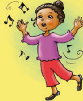
Singing and dancing