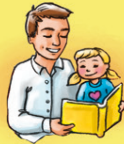
Being read to