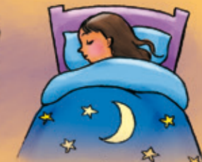
I go to bed.