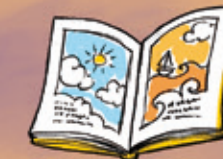
I look at a book.