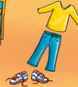
I get dressed.