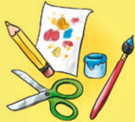
Doing crafts, drawing