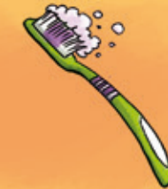
I brush my teeth.