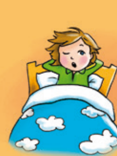
I get up.