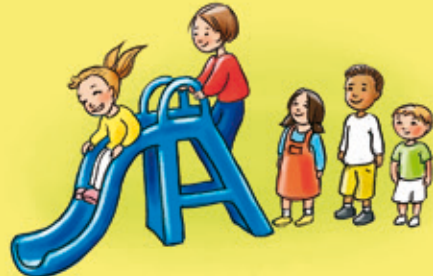
Waiting for my turn