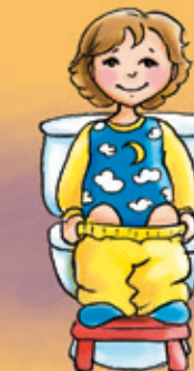
I use the toilet.