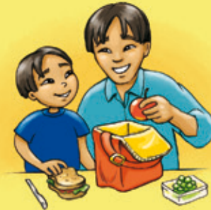
Cooking with an adult