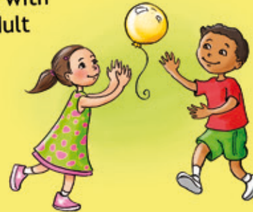
Playing with friends