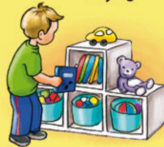
Learning to perform small tasks