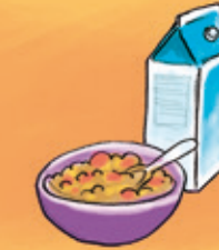
I have breakfast.