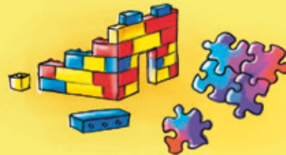
Playing with blocks and puzzles