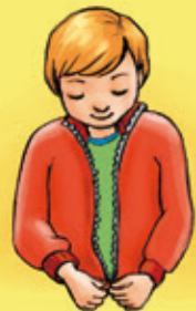
Developing my independence