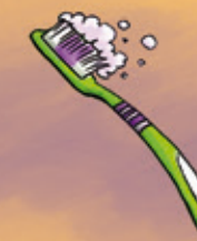
I brush my teeth.