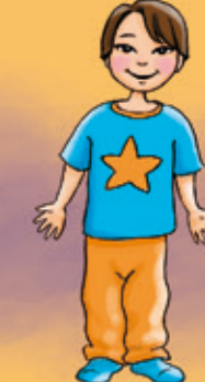
I put on my pajamas.