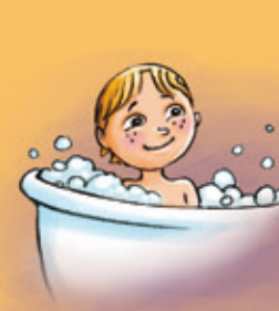
I take a bath.