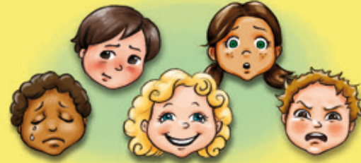
Learning how to manage my emotions