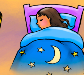
I go to bed.