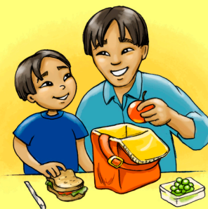
Cooking with an adult