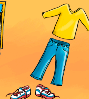
I get dressed.