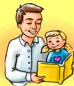
Being read to