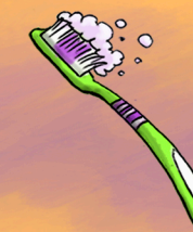
I brush my teeth.