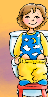
I use the toilet.