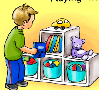
Learning to perform small tasks