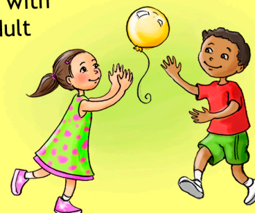
Playing with friends