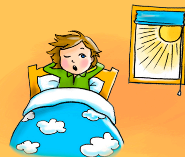
I get up.