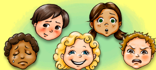
Learning how to manage my emotions