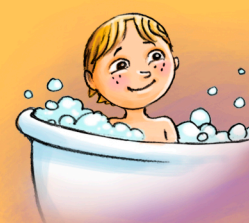
I take a bath.