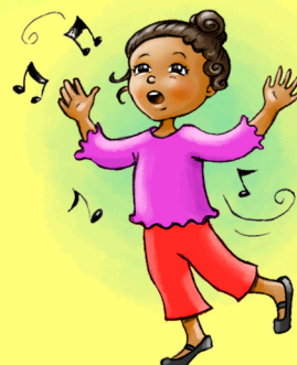
Singing and dancing