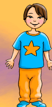
I put on my pajamas.