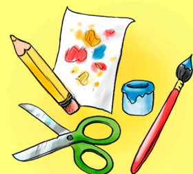
Doing crafts, drawing