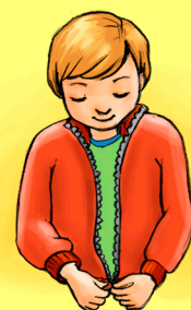
Developing my independence