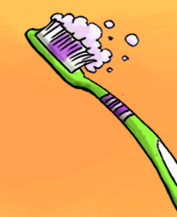
I brush my teeth.