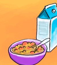
I have breakfast.