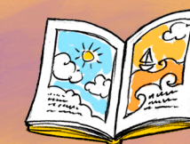
I look at a book.