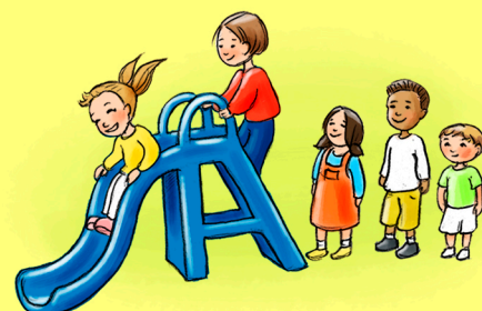
Waiting for my turn